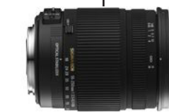
18-250mm SLR Lens with Anti-Shake Stabilizer

The magnification of a macro lens is usually expressed as a ratio.