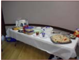
Anniversary Food is Served