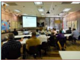
Members listen to the day's presentation