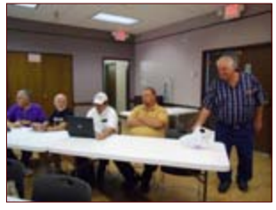
The "last row computists" with a question to the hosts speakers